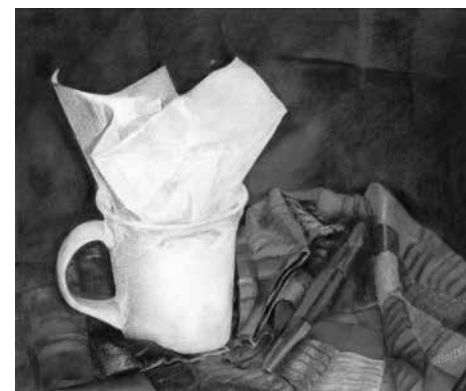
Breakfast Leavings, Ruthe Sholler

This is a class for beginners with a passion for discovery and creativity. Students will learn a variety of techniques for creating colorful, dynamic pastel paintings. Weekly informational handout sheets will be provided and used for discussion and as reference materials along with demonstrations by the instructor. The goal is to provide a sound foundation for the creation of pastel paintings during each session. 7/9–8/27 Wed am 9:00–12:00 $195M $235NM 8 classes