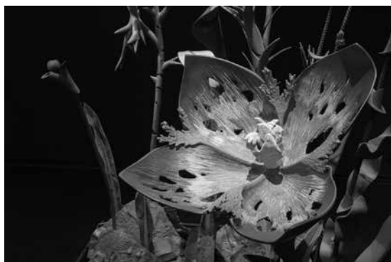
Dark Garden (detail), Linda Huey

“Clay is my pathway into the natural world. Both my pottery and sculpture are inspired by an investigation of nature, in process and in form. Over the years, I have developed distinctly different bodies of work, yet one recurring theme has been the relationship of growth to decay, whether in cityscape or in natural imagery.”