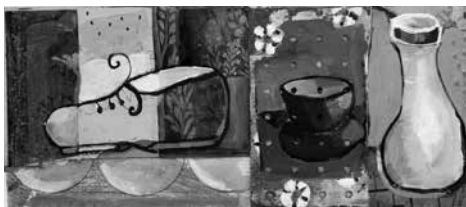
Pompeii, Gary Nisbet

7/8–8/26 Tues pm 7:00–9:00 $205M $245NM 8 classes