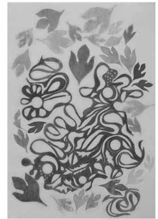
Slow Turning, Monice Morenz