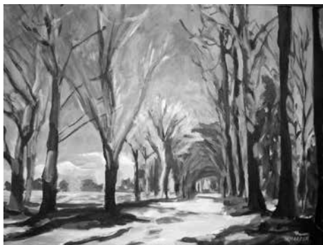
Fall Landscape , Lisa Marder

9/15–11/3 Thurs am 9:30–12:30 $240M $285NM 8 classes