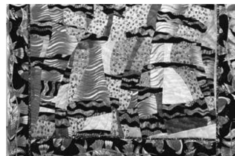
Quilt Detail, Virginia Holloway

Students will apply small strips of fabric directly to a batting or fabric foundation to improvise abstract designs. The results may be finished as wall art or used in making functional objects. The students will explore use of color, pattern and design elements to make a unique work of art. 9/17–9/18 Sat–Sun 9:00–4:00 $155M $200NM 2 classes