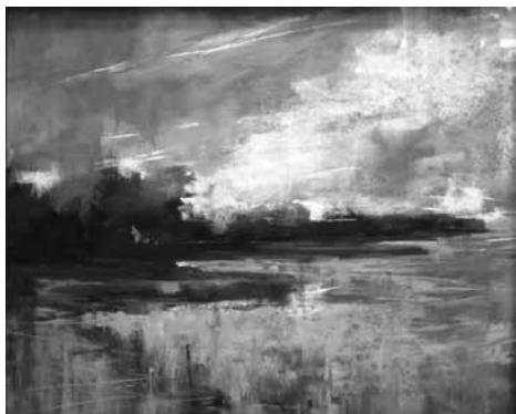
Marshside , Laurinda O'Connor

9/13–11/1 Tues pm 12:30–3:30 $240M $285NM 8 classes