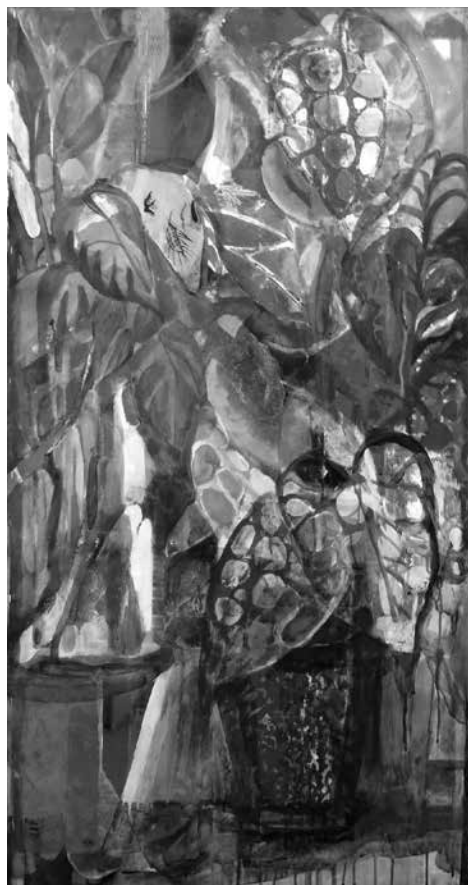
Elephant Ears, Karen Cass

This course is for students of all ability levels who wish to explore the endless possibilities of a layered image. You will be encouraged to allow chance and the element of surprise to play an active role in your art-making process. Emphasis will be placed on preparing the proper surfaces for collage and multiple layers of paint. Recycled materials, handmade and printed papers, various adhesives and acrylic paint will be used for our projects. A variety of techniques and subject matter will be introduced and students may apply techniques to their independent work. We will have group critiques and share many examples of mixed media work to inspire and further illuminate the process. 9/14–11/2 Wed pm 6:00–9:00 $240M $285NM 8 classes